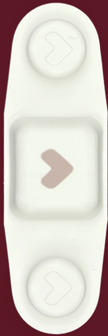
Actual Patch Size